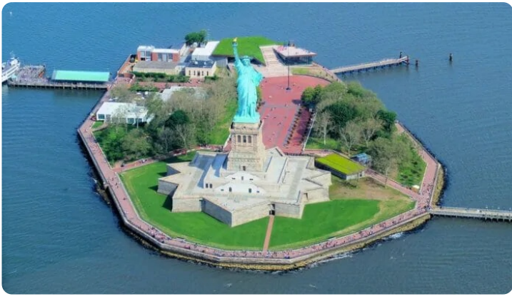
Liberty Island (from 3:30pm - 6pm)