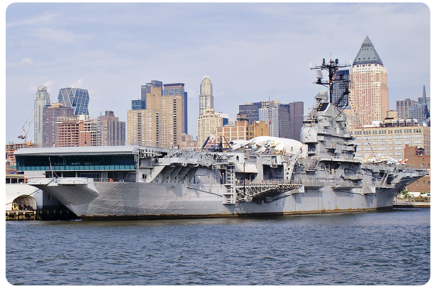
Intrepid Sea, Air & Space Museum (6:30pm - 8pm)

There's no equipment you need to take with you but I would recommend bringing a camera to take pictures of the sights, to bring money for lunch and something to drink. The total price is 140$ per person. The tickets for bus and the ferry are included, but you need to buy food by yourself. You can book the tour in the travel agency but be fast because only 20 people can take a part in the tour.