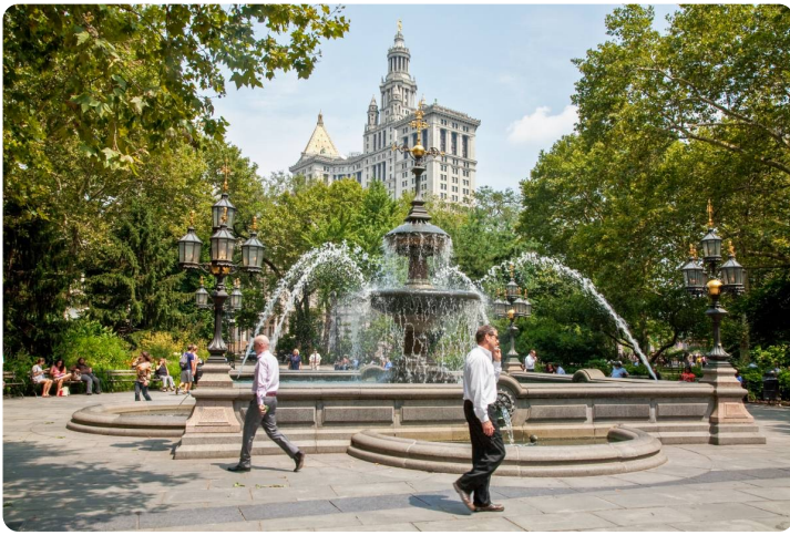
City Hall Park (from 10am - 11:30am)