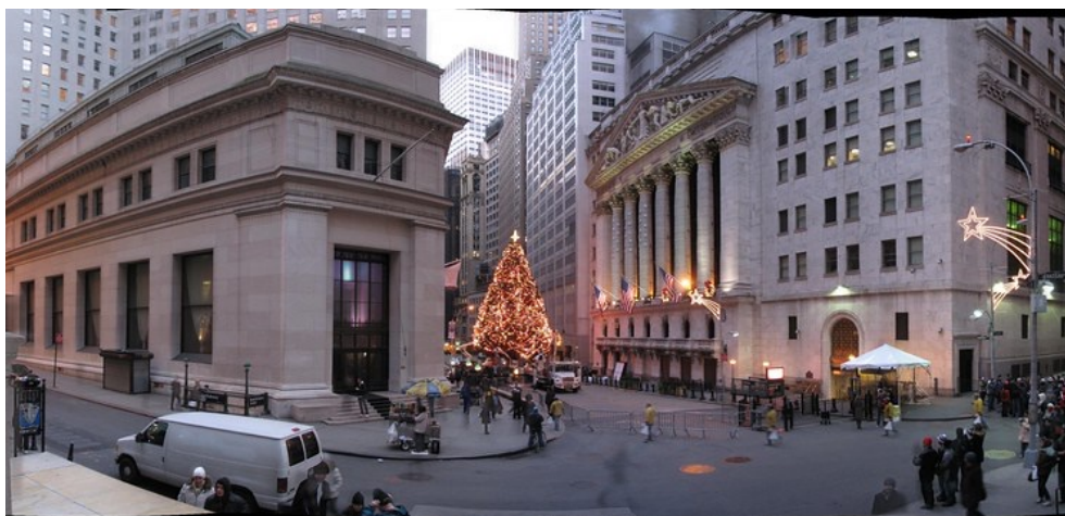
Wall Street Historic District (from 1pm - 2pm)